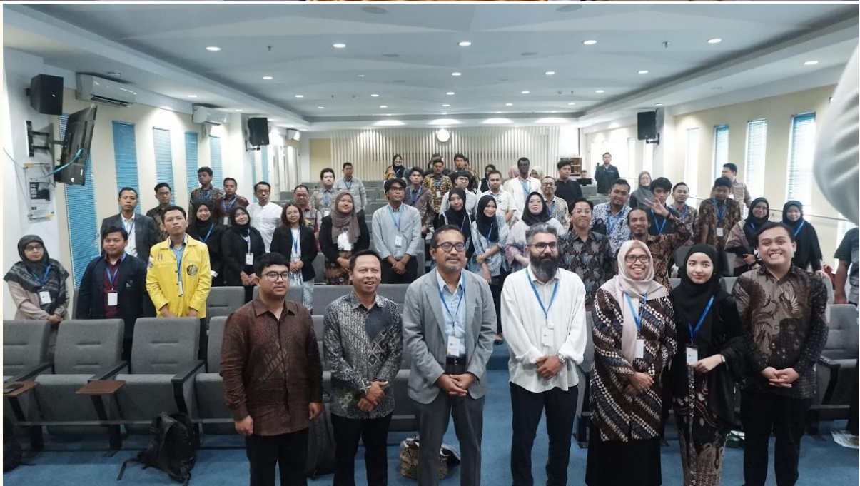
3. Lampiran Foto Kegiatan