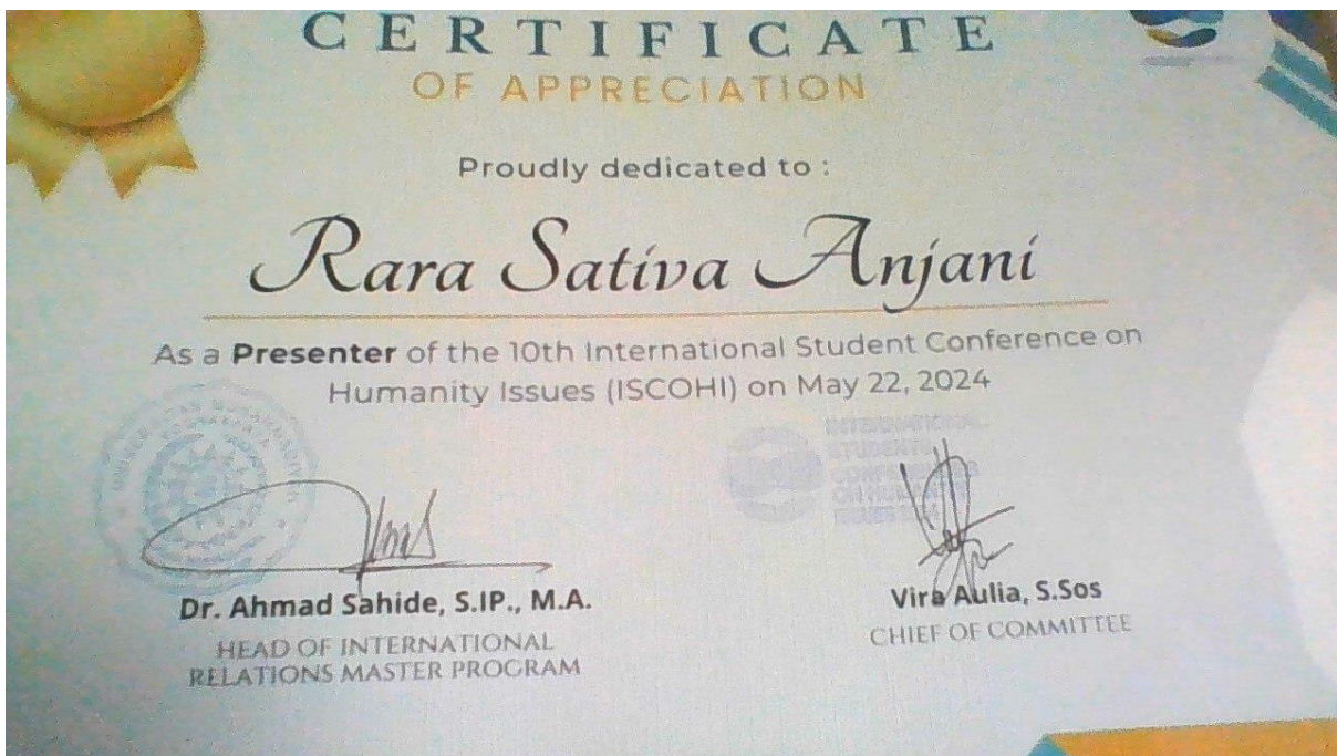
2. Lampiran Sertifikat kegiatan